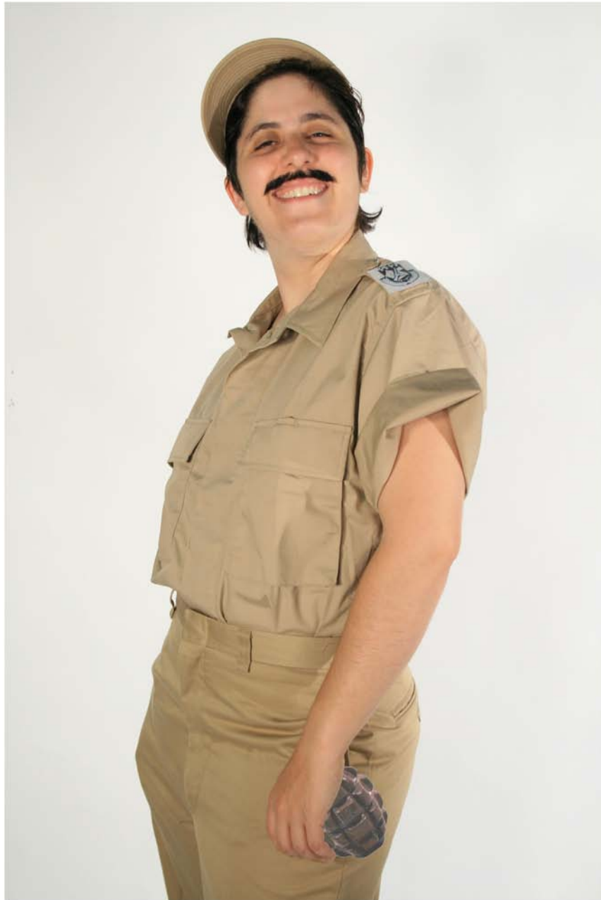
self portrait as a Jewish terrorist