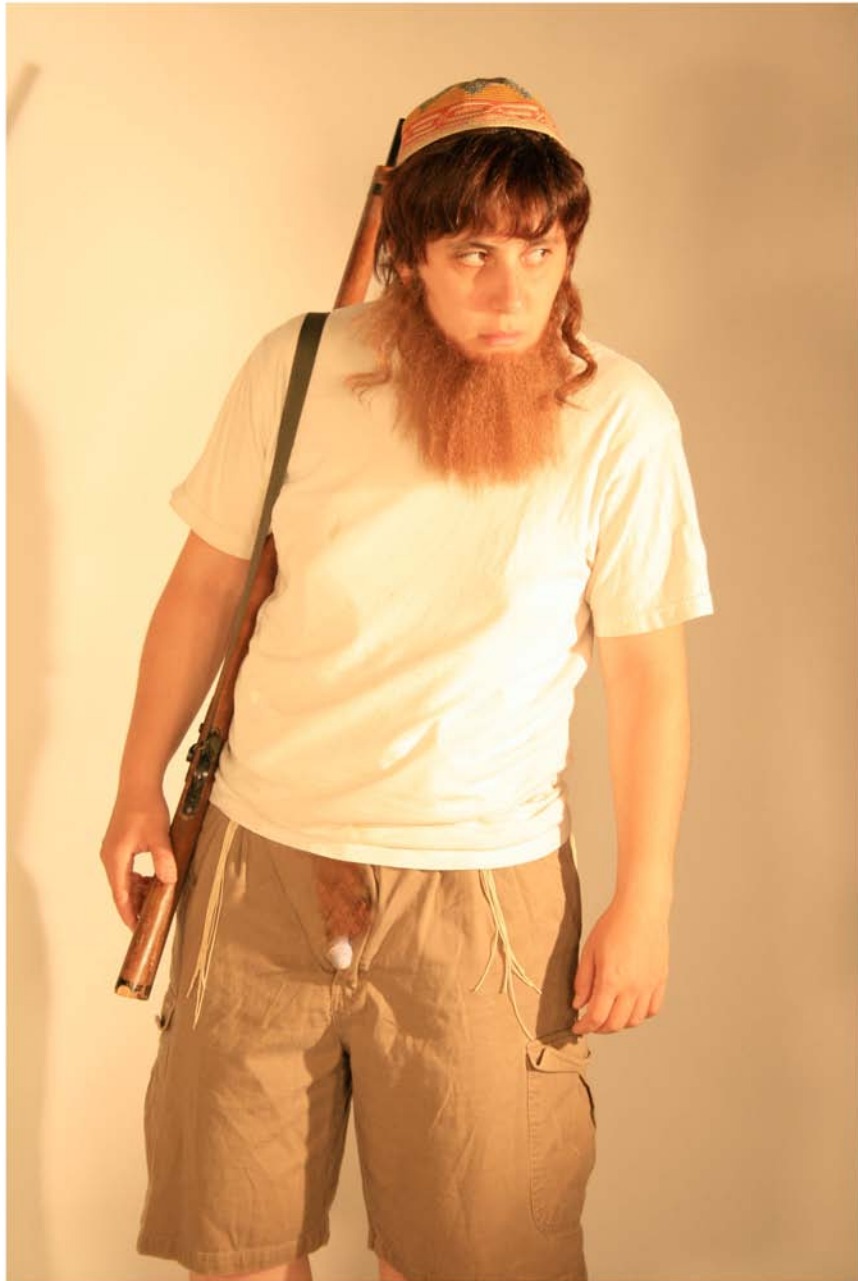
self portrait as a homophobic Settler