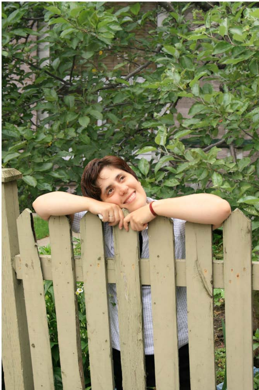
self portrait as my mother in Jerusalem, 1957