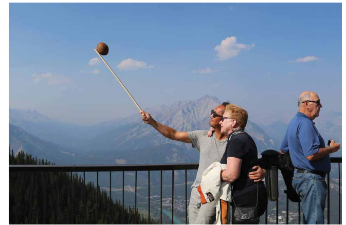
Kotama Bouabane, Sulphur Mountain I , C-Print, 28"x42", 2015

KB: It's complicated and difficult trying to learn the khene , but I think that there is something important in handling materials, such as the coconuts, that activates the materials in an important way. I see a lot of this show as an extended experiment. When I was going into the darkroom and using the coconut water and pieces of coconut, I didn't know how it would work out. I didn't know the coconut photographs would have an anthropomorphic undertone and in that way, I don't know how the music will turn out or if it will allow the viewer to make the connections I hope it will. I think a lot about failure and how it can be productive.