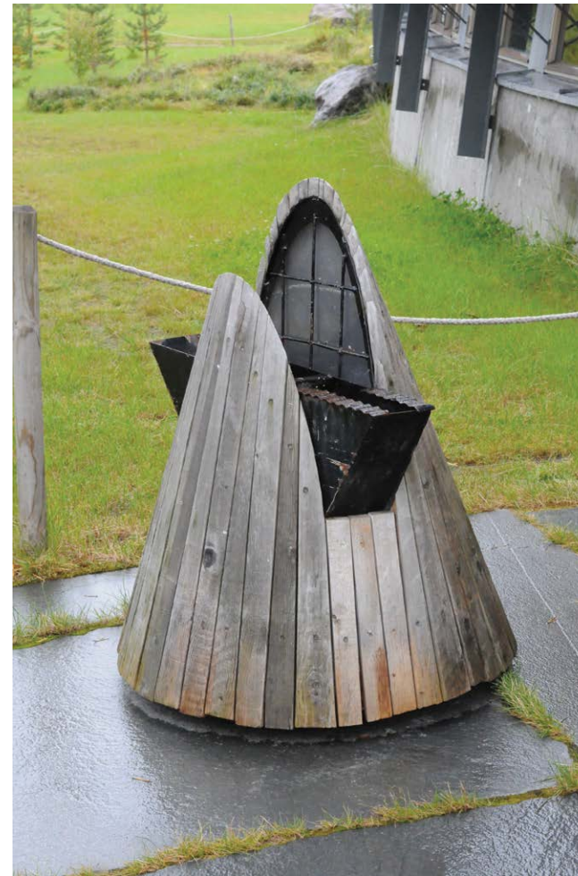
Joar Nango, Ashtray at the entrance of the Sámi parliament that looks like the Sámi parliaments assembly hall , 2015

JN: Yes, that is relevant in that we took ancient routes and lanes of traffic as a starting point for the installation. The border there between Finland and Norway is very new and you can really feel its effects on the communities. For example, part of the border was erected between these twin villages on the same riverbank that had always had a lot of traffic and exchange between them. We thought it would be interesting to look at the interaction between them and so we established an informal 'wilderness tour'- style shuttle to transport people across the border, negotiating and engaging in conversations with people. It's interesting to think about the shuttle as a kind of flexible space. As we were moving between the different spaces on opening day, we had parties and gatherings, and we built various improvised structures in these places. At the gas station we used the plexiglass from the Shell sign and built furniture for the party, and then we made a new sign that said "We don't follow routes, and we don't conform to regulated orders." So it was a text relating to these old, informal routes of travelling within a borderless culture, and, of course, about an anarchist energy, opposing the law, and keeping our traditions alive. There is a saying in the Sámi area, "If you want to be Sámi, you have to break the law." It is not because you have to break the law directly,