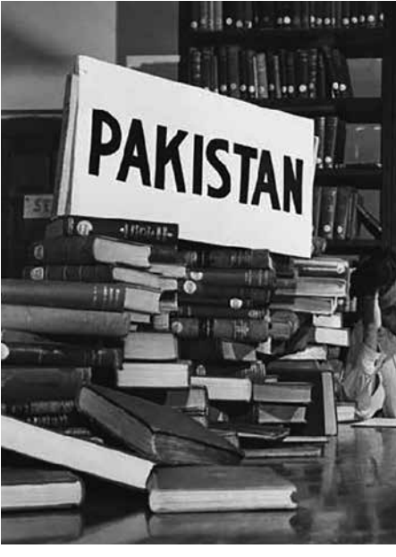
Division of a library at the Detail, Independence Day 1934 -

The bouquet presented by Kapwani Kiwanga, from her Flowers for Africa series, was reconstituted from a photograph of the ceremony of independence of the Federation in June, displaying a choir of young singers holding flowers in their hand. Flowers for Africa comprises several floral compositions linked to independence ceremonies in former European colonies in Africa. Recreated by Kapwani Kiwanga from photographs, these bouquets evoke - by metonymy - the way transfers of powers were staged during independence days. They also enact an anachronistic and performative relationship to the absent documents that inspired them.