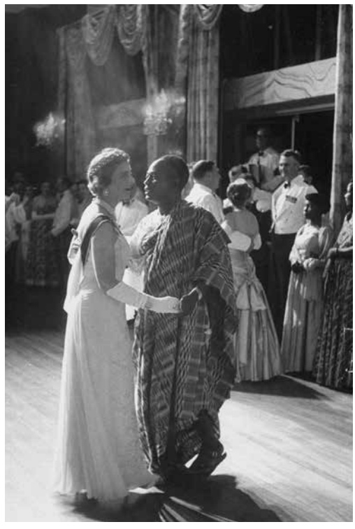
Getty vs. Ghana, 2012, Maryam Jafri. Getty Images

African countries formerly colonized by France have large gaps pertaining to certain key events of the colonial period, even if, in honor of the Golden Jubilee of Independence, copies of these archives have finally been returned to some African nations, thanks to the miracle of digitization."