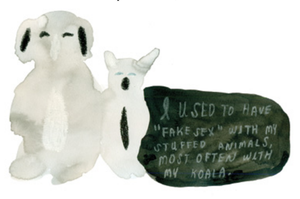
Kerri Flannigan coming of age stories 2: hooking up, 20 hk and pastel on paper).

culture within mainstream media are often packaged and presented to viewers only after aggressive editing, remixing, and marketing strategies. In the latter, any signs of difference and vulnerability are filtered out to create more spectacular, celebratory versions.