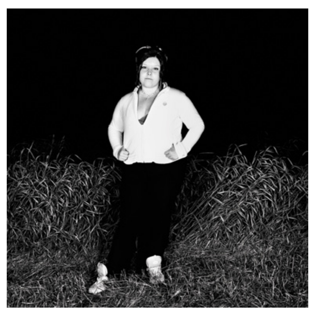
Guillaume Simoneau Untitled 31 , Lévis, Canada, 2004 from the Between Grass and Steel series, 2004–2011 (chromogenic print 1/6).