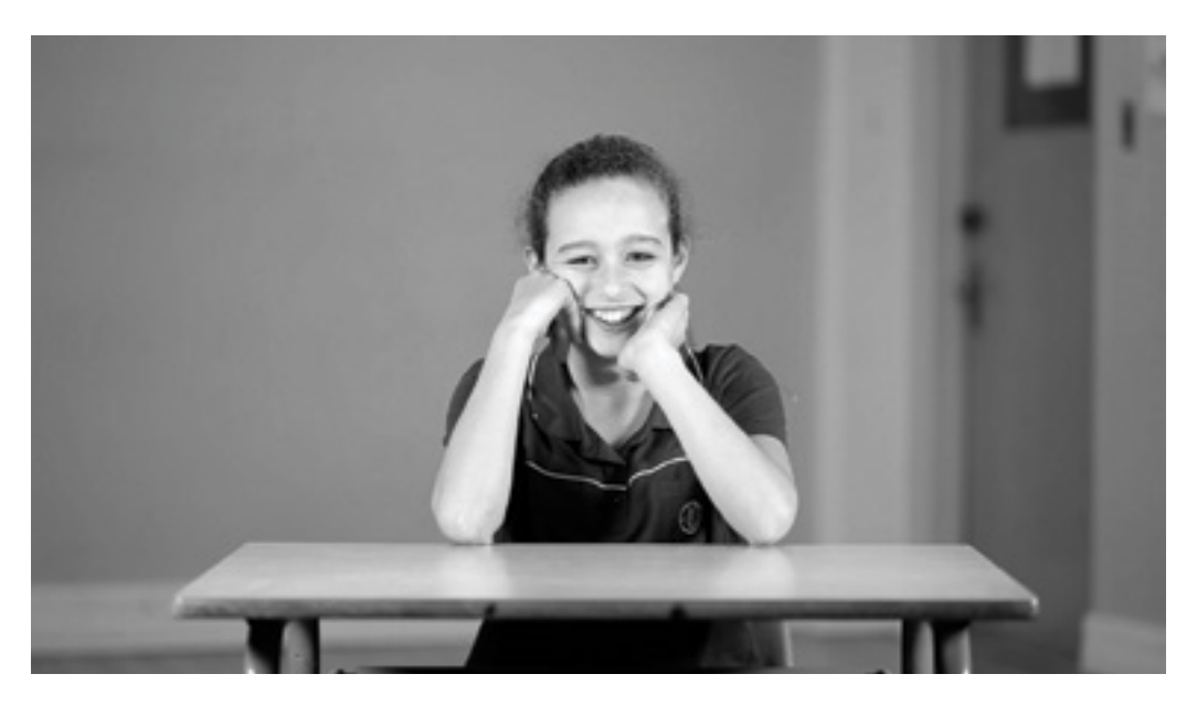
Emmanuelle Léonard Le beau, le laid et la photographie, 2011 (HD video still).

subject matter in this work? (3) Can you describe how and why you came to treat the subject matter in the way that you did? For example, why did you use this medium and approach? (4) What comes to mind when you think about your own youth in relation to this project?