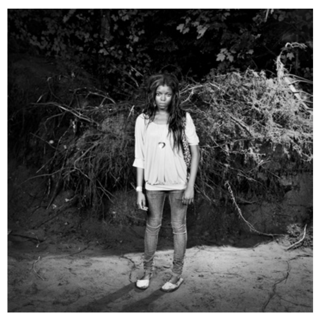
Guillaume Simoneau Untitled 02, Lévis, Canada, 2008 from the Between Grass and Steel series, 2004–2011 (chromogenic print, 1/6).

Other artists turn to the study of ephemeral traces of youth cultures, with a particular interest in self-expression. In Screaming Girls (2005), Jo-Anne Balcaen edits together archival footage of early rock 'n' roll concerts (primarily from concerts featuring Elvis Presley and The Beatles, though the performers are not shown) in order to explore female fandom, which is revealed as a highly performative ritual of an almost feral nature. These early demonstrations of fandom are emblematic of the phenomenon of youth culture, which emerged in the post-war era and marked a clear divide between the young and the old in terms of musical tastes and socially acceptable behaviour. In Screaming Girls , Balcaen removed the audio to better foreground the girls' gesturality, while in Concert Posters (2007), she alludes to the element of sound by showcasing the words cried out by fans. Her pastiche of the cheaply produced rock concert poster functions as a kind of mini-archive of