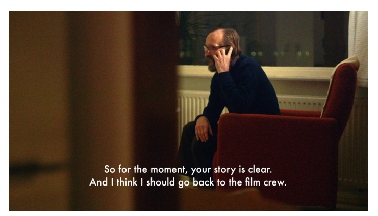
Naeem Mohaiemen, Last Man in Dhaka Central, still, video, 2015, 82 min.

The Young Man Was series has been supported by Creative Capital, Creative Time, Puffin Foundation, Franklin Furnace, Rhizome, Arts Network Asia and a Guggenheim Fellowship. The three films screened together in the program I don't throw bombs, I make films at DocLisboa 2015. The current iteration at VOX is organized by Experimenter (Kolkata) and LUX (London).