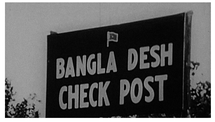
Naeem Mohaiemen, Afsan's Long Day, still, video, 2014, 40 min.