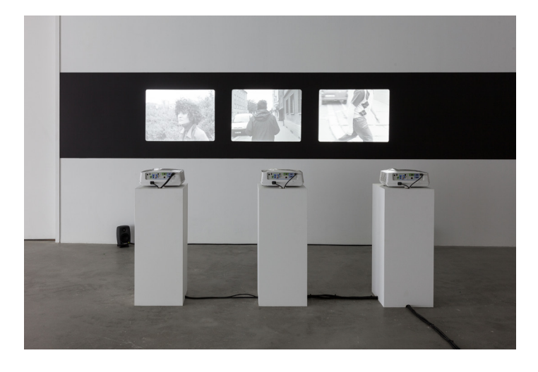
Front: Ján Mančuška, Double , still, 2009, video installation with soundtrack, 3 min. 29 sec.