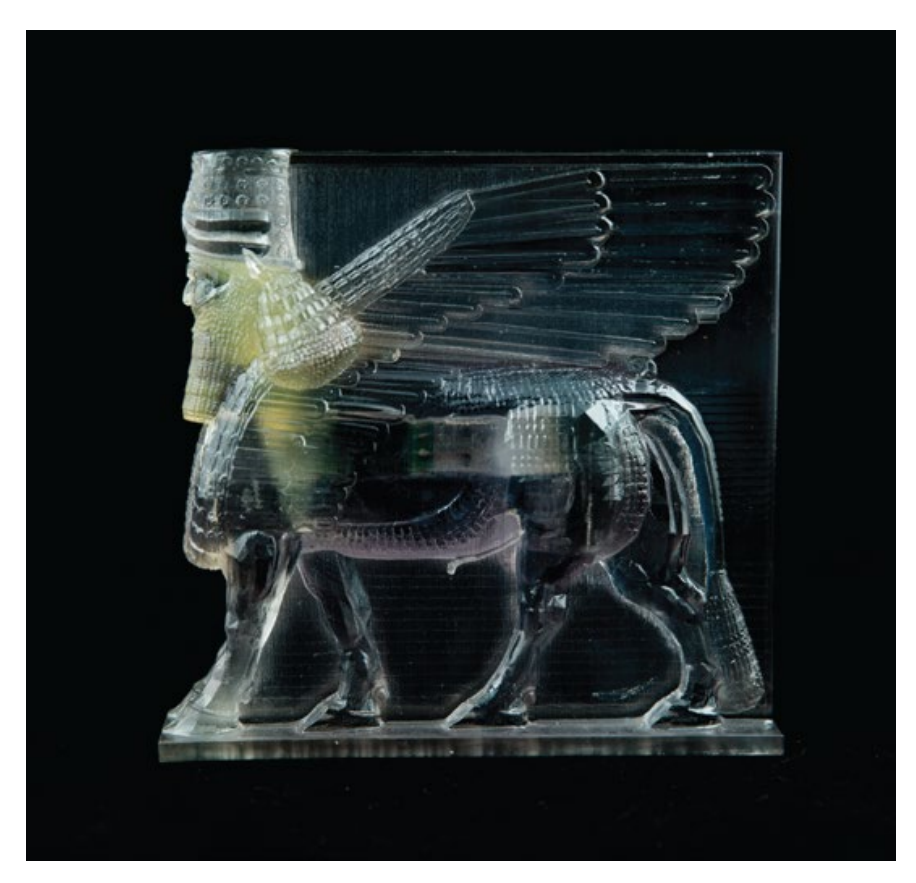
Morehshin Allahyari, Material Speculation: ISIS, Lamassu, 2015

riod city of Hatra and series objects from the Assyrian city Nineveh. Going beyond metaphoric Material gestures, Speculation offers a practical and political archival methodology for endangered or destroyed artifacts. In line with Allahyari's previous work, it also proposes 3D technologies as a tool of resistance. For this project, a flash drive and memory card containing data such as images, videos, maps, and