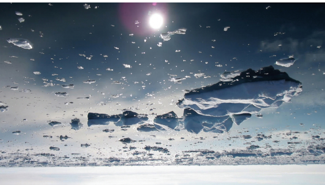
Ursula Biemann, Subatlantic , 2015, video.