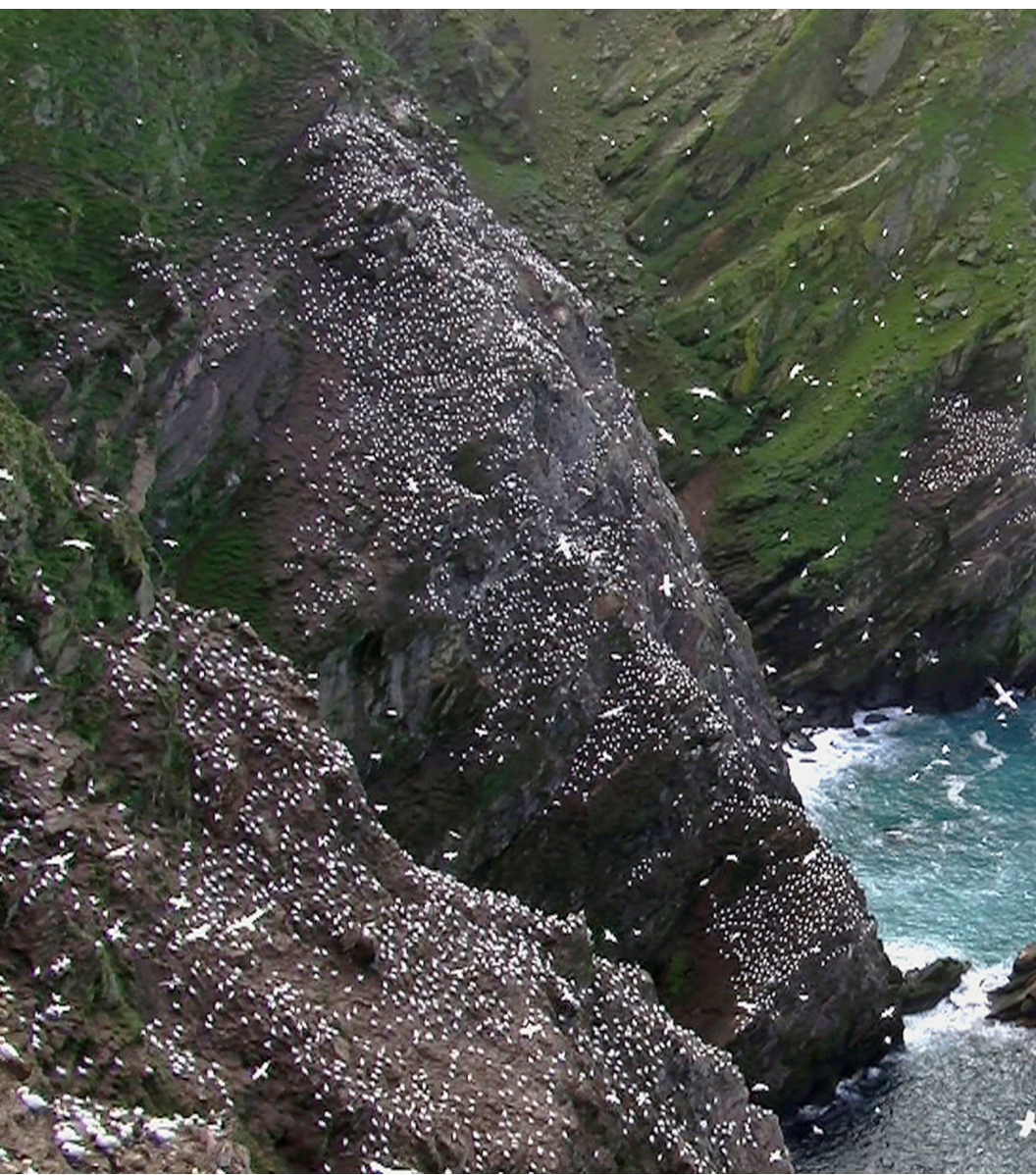
Ursula Biemann, Subatlantic , 2015, video.