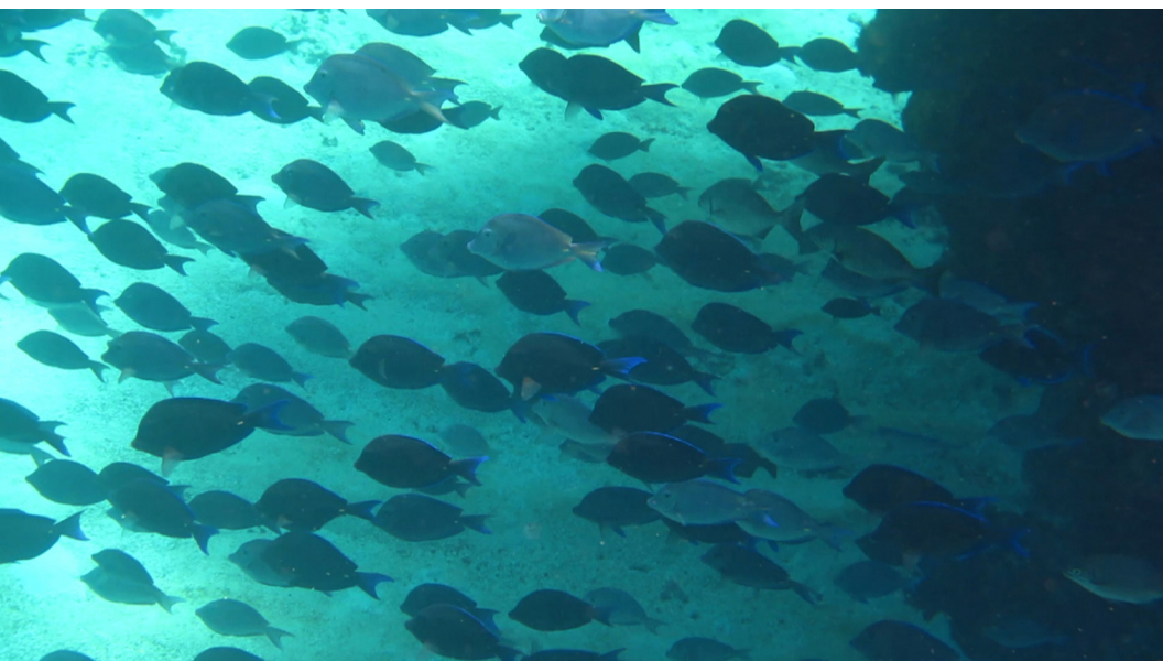
Ursula Biemann, Subatlantic , 2015, video.