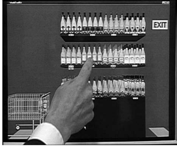
The Creators of Shopping Worlds, Harun Farocki.

in which surveillance technologies track not only the movements of unsuspecting shoppers but also the movement of the customer's gaze.8 The purpose is to achieve maximum profitability by ensuring that the motion of the shopper's body and vision lead to maximum consumption of material goods, in concert with a pastiche environment ranging from Greek temples evoking a classical idyll to winding streams of water leading, not to nature, but to purchases.