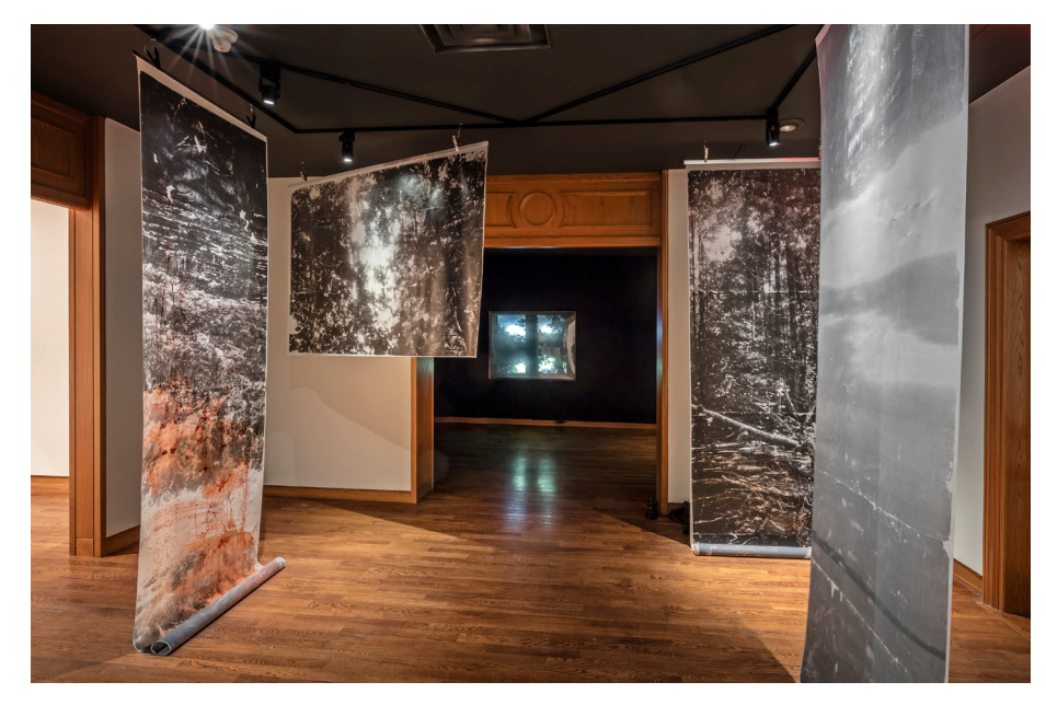
Sandra Brewster, A Trace, 2017, Installation view: Master of Visual Studies Studio Program Graduating Exhibition, Art Museum, University of Toronto, 2017.

<sup>1</sup> Arjun Appadurai, "Grassroots Globalization and the Research Imagination," Public Culture 12.1 (Winter 2000): 1–19. Activist and writer Arjun Appadurai describes the development of "Globalization from below" as a result of agency amongst citizens who live in marginalized regions through which, "...a series of social forms has emerged to contest, interrogate, and reverse these developments and to create forms of knowledge transfer and social mobilization that proceed independently of the actions of corporate capital and the nation-state system (and its international affiliates and guarantors)." This is thought of in connection with Denise Ferreira Da Silva's writing on rethinking cultural difference and sociality through models of universal entanglement in her 2016 text "On Difference Without Separability," published in the catalogue of the 32a São Paulo Art Biennial, "Incerteza viva" (Living Uncertainty)."