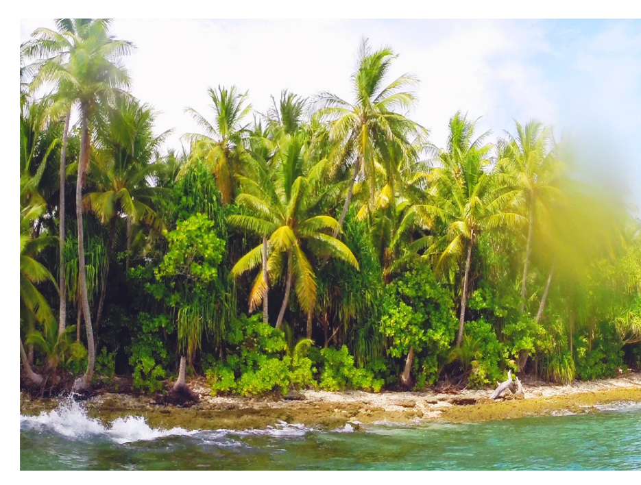
David Hartt, still from adrift, 2015.

Baghriche's work tackles the way nationalism takes root through visual metaphors, by engaging formal strategies to obscure symbols of optimism, uniformity and exceptionality that are claimed by a nationstate upon its founding. In Elective Purification and Enveloppements , Baghriche pares down global flags to shared motifs and colours, thereby undermining the visual rhetoric around nationalism in favour of representations of pluralism.