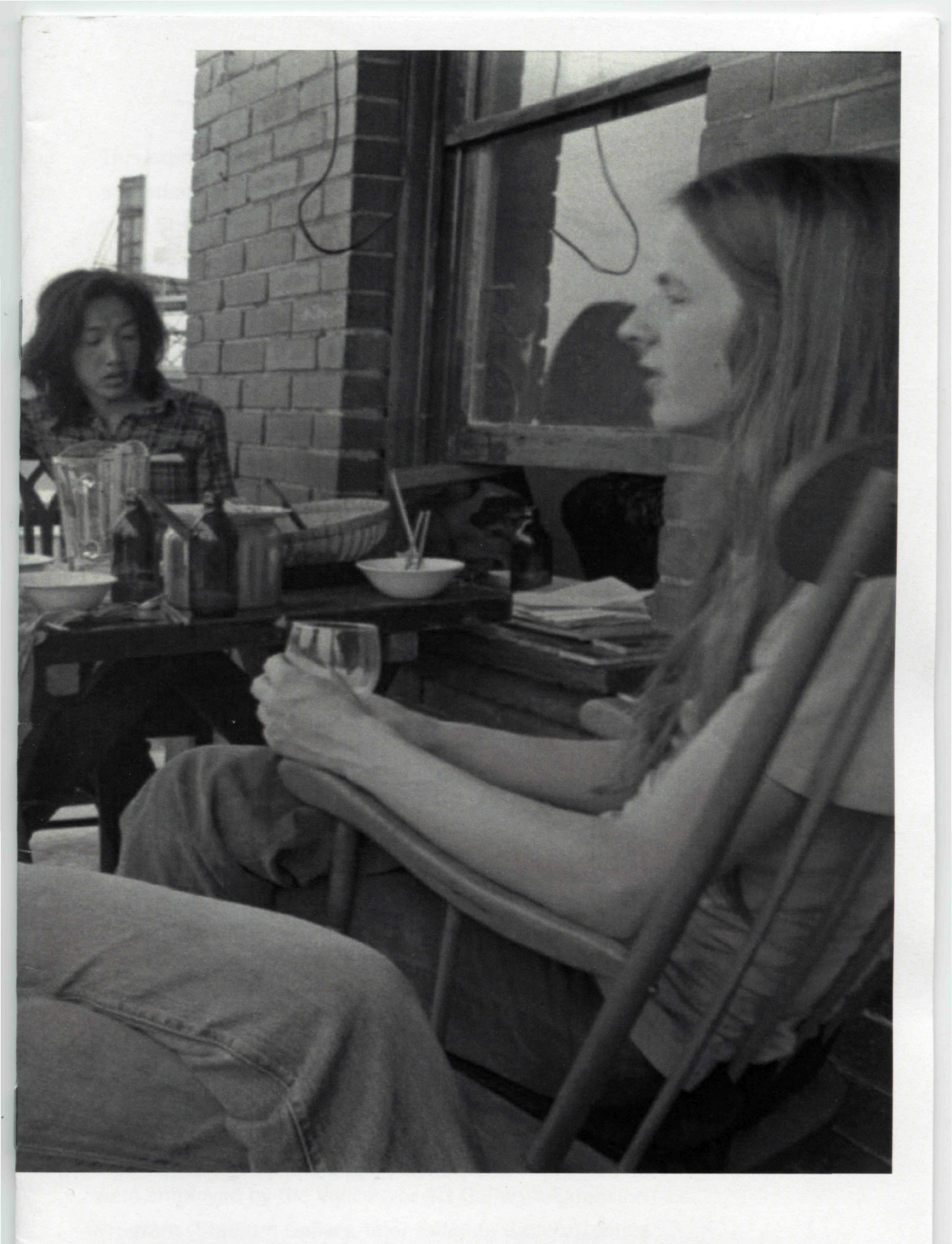
MAINSTREETERS: Taking Advantage, 1972–1982 January 9 – March 14, 2015 | Satellite Gallery