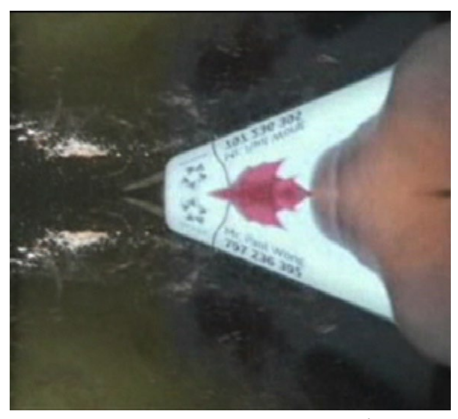
Perfect Day, 2007