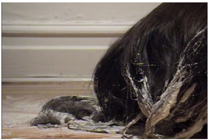
Insides Out: Head, Shoulders, Knees & Toes, 2012