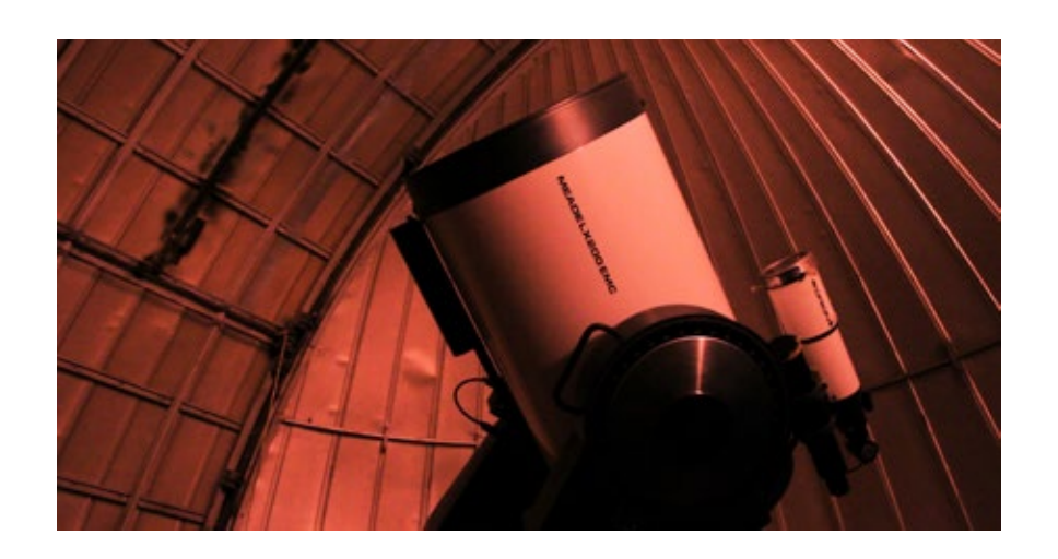
Temps Mort, 2012