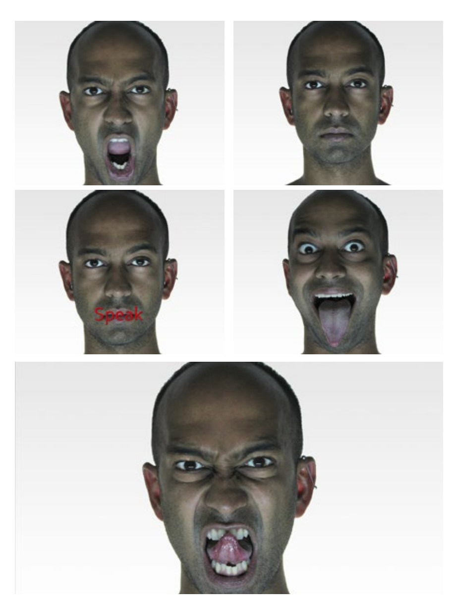
Devil's Noise, 2011