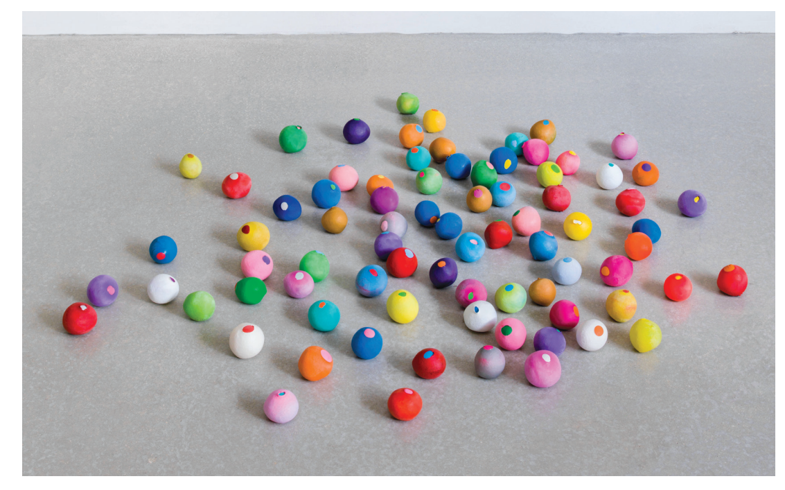
Claire Fontaine, Untitled (Corps étranger), 2017. Latex balloons, plastic bags, hempseed, yellow and red millet, linen seeds, canary seeds, and whole oats. Eighty-one individual elements, dimensions variable.

Water as a medium of storytelling and archive finds further resonance in Deborah Ligorio's Care: A Somatheory Encounter (2017). The work comprises a video and an installation in which