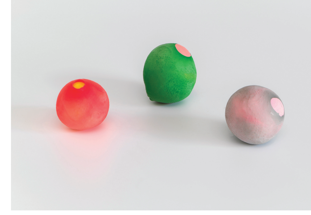
Claire Fontaine, Untitled (Corps étrangers) (detail), 2017. Latex balloons, plastic bags, hempseed, yellow and red millet, linen seeds, canary seeds, and whole oats. Eighty-one individual elements, dimensions variable.

Workshop presented in preparation for The Let Down Reflex, curated by Amber Berson and Juliana Driever for Take Care, Circuit 2: Care Work, October 16–November 4, 2017 at the Blackwood Gallery.