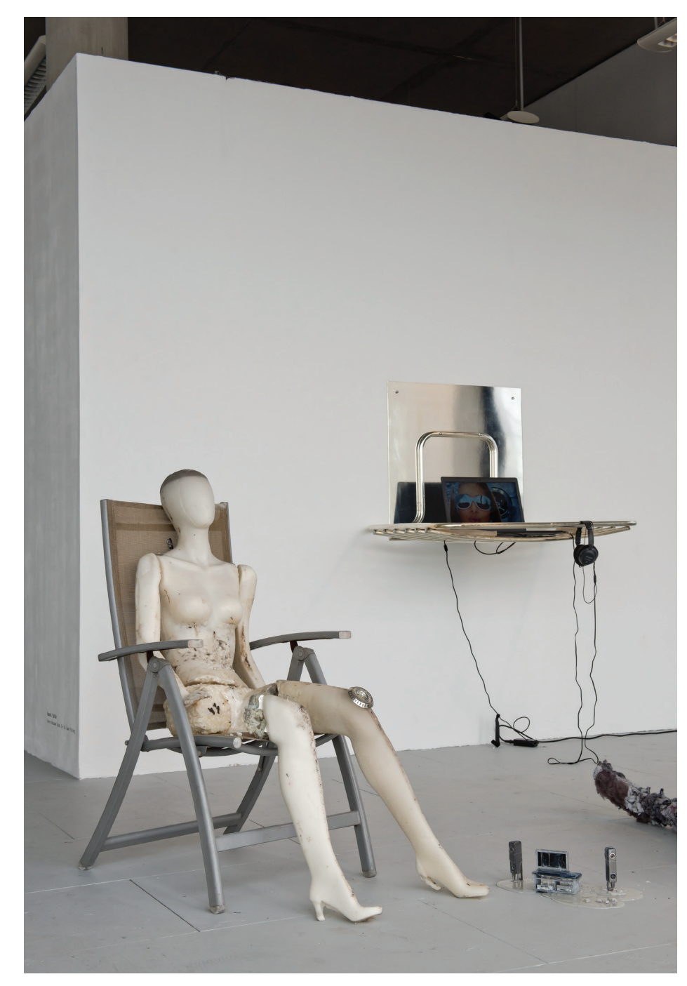
Laura Yuile, Mother Figure #1 and Public Feature (installation view), 2017. Steel, chrome paint, laptop, digital video, soap, eucalyptus oil, dirt hand-picked from "The Street," Stratford, Westfield, London, small hi-fi system, small "home" decorative wooden word blocks, glass wax.