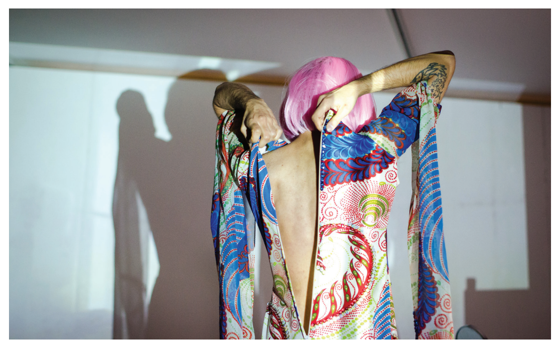
Raju Rage, Visibility or Opacity (performance still), 2016.

tumour from the body. By contrast, the small, brightly coloured balls scattered on the floor in Untitled (Corps étrangers) (2017) present a scene of horizontal gathering and assemblage. Filled with seeds, the balls are modeled on those used in the anti-gymnastics techniques devised by Thérèse Bertherat. When placed under parts of the body they initially cause discomfort and contraction. Only later do they create a form of physical release that Claire Fontaine equates with the positive impact that foreigners can have on society: "Initially rejected, they can bring the community to a new state, more harmonious and balanced than the previous one." The ambiguous presence of the cover of Shulamith Firestone's 1970 book The Dialectics of Sex: The Case for Feminist Revolution in the brickbat missile of 2014, points to the explosive power of this radical, proto-cyberfeminist's ideas about surrogate childbirth and non-conformist parenting. In the context of Habits of Care . Firestone's book evokes the difficulties that women continue to face in negotiating their own care and flourishing in relation to the many other care-