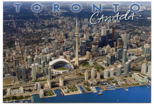
Luis Jacob, Sightlines , 2017. Vintage postcards, reference image.