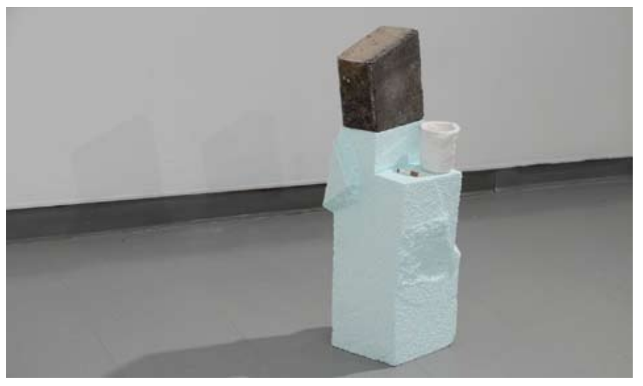
VSVSVS, Drift, installation view at Centre Bang, 2015.