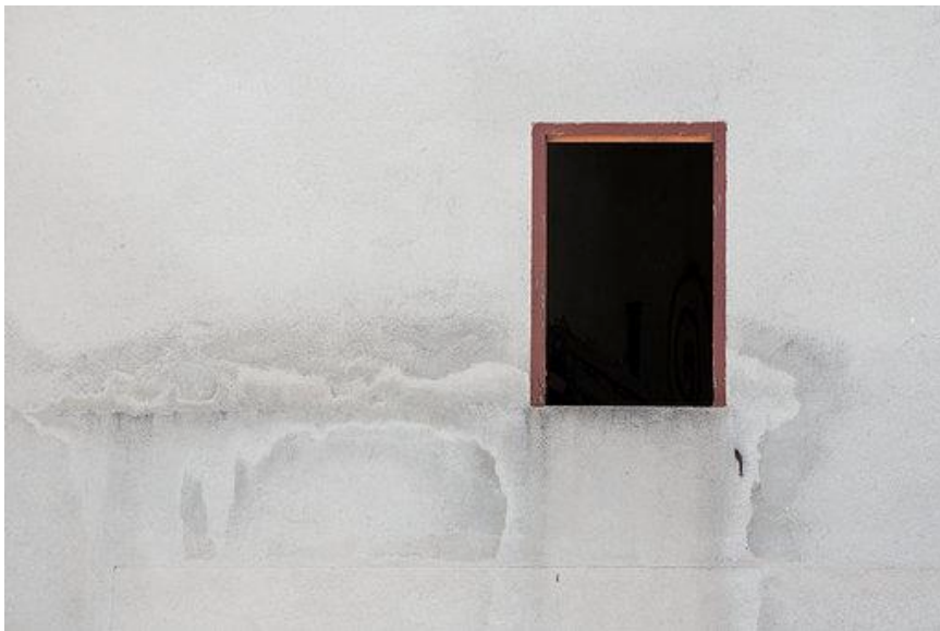
Figure 12. Fenêtre (Barjols) 0827-059 , 2010, archival ink jet print, 43 x 56 cm. (17 x 22 in.).

Witness to the outside destruction, Fenêtre (Barjols) 0827-033 is located on the ground floor of a building and just across a narrow river, where it would have been easy for kids to throw rocks or any projectiles at it. It's always a mystery to try to figure out what is behind a certain event; only a rich and elaborate drawing from its destructive history is left behind for others to see.