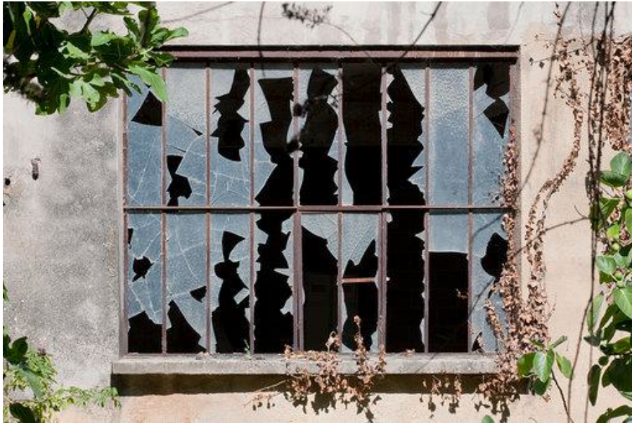
Figure 11. Fenêtre (Barjols) 0827-033 , 2010, archival ink jet print, 43 x 56 cm. (17 x 22 in.).

Witness to the outside destruction, Fenêtre (Barjols) 0827-033 is located on the ground floor of a building and just across a narrow river, where it would have been easy for kids to throw rocks or any projectiles at it. It's always a mystery to try to figure out what is behind a certain event; only a rich and elaborate drawing from its destructive history is left behind for others to see.