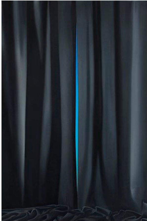
Figure 4. On a Clear Day , 2018, oil on canvas, 183 x 122 cm. (72 x 48 in.)

A second painting, On a Clear Day , is about two curtains that are closed, but not entirely closed. They are closed just enough to allow the spectator to see a blue sky in the interstice, between the two curtain panels. These curtains are tools or pieces of the equipment I frequently use in my studio for all sorts of photographic purposes. One day, I decided -- again intuitively -- to play around with them, thinking they could be an interesting subject for a painting.