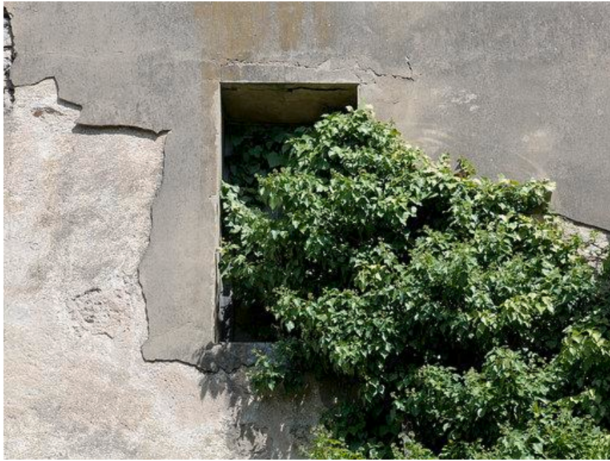
Figure 13. Fenêtre (Barjols) 0901-006 , 2010, archival ink jet print, 43 x 56 cm. (17 x 22 in.).

Fenêtre (Barjols) 0901-006 is very different from the previous ones. On this large wall, vegetation invades the window, penetrating inside the building from the outside, or is it the other way around? It feels like both of the opposite directions are possible... hard to say which one is more accurate, more truthful. The frontier that represents the window has disappeared. The inside and the outside are confused, as often happens when we are confronted with ruins.