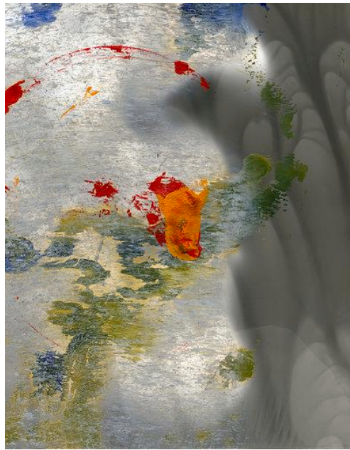
Figure 2. Soubresauts #83, 1997, oil and pastel on photograph, 26 x 20 cm. (10 x 8 in.)

The Soubresauts series introduced a kind of osmosis between photography and painting in my practice. From that moment on, and as the years went by, all of my work as a painter benefited from my photographic practice. When I think of a concept for a painting, I develop the initial idea through photography and then eventually reintroduce it into the realm of painting.