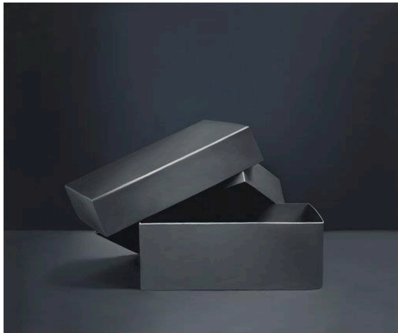
Figure 14. Boites # 12 , 2014, oil on canvas, 153 x 183 cm. (60 x 72 in.).

Fenêtre (Barjols) 0901-006 is very different from the previous ones. On this large wall, vegetation invades the window, penetrating inside the building from the outside, or is it the other way around? It feels like both of the opposite directions are possible... hard to say which one is more accurate, more truthful. The frontier that represents the window has disappeared. The inside and the outside are confused, as often happens when we are confronted with ruins.