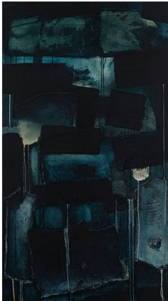
Figure 6. Untitled , 1975, acrylic and collage on canvas, 214 x 122 cm. (84 x 48 in.).

In my final year (1975) as an undergraduate student, I did a painting in which Pierre Soulages is still very present: