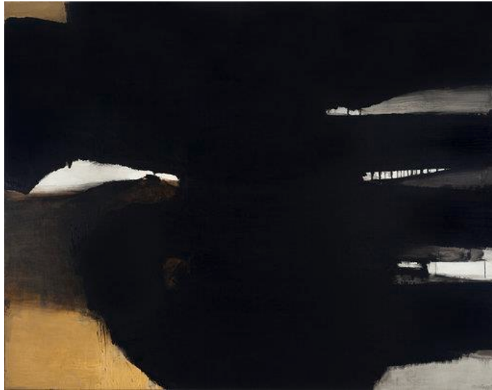
Figure 5. 5 février 1964 , Pierre Soulages, oil on canvas, 236,5 x 300,5 cm. (93 x 118 in.).

In my final year (1975) as an undergraduate student, I did a painting in which Pierre Soulages is still very present: