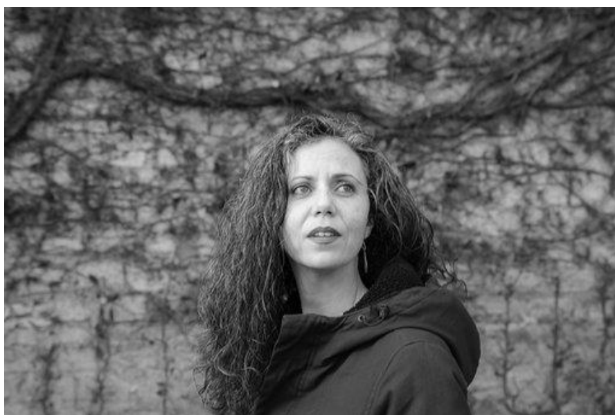
Figure 9. Lourdes Segade , 2014, archival B/W ink jet print, 43 x 56 cm. (17 x 22 in.).

Here is another portrait done in Paris, of Spanish artist Lourdes Segade based in Barcelona. I asked her to stand in front of a large wall covered with vegetation, a labyrinth of roots and branches, all in harmony with her hair. I would not say that it is about perspective; it is more about creating an environment. The wall is out of focus not to distract viewers from her hair and face. That relationship between the wall and her hair is of a poetic nature. They had to be juxtaposed. As I said before, I often use depth-of-field as a device to direct the spectator’s eyes to the parts of the image that are of some significance. It is a privileged tool. Poetry (visual or literary) is to me about bridging distances: in this portrait, the wall vegetation and Lourdes’ hair become related. Portraiture is about bridging someone to someone or something else.