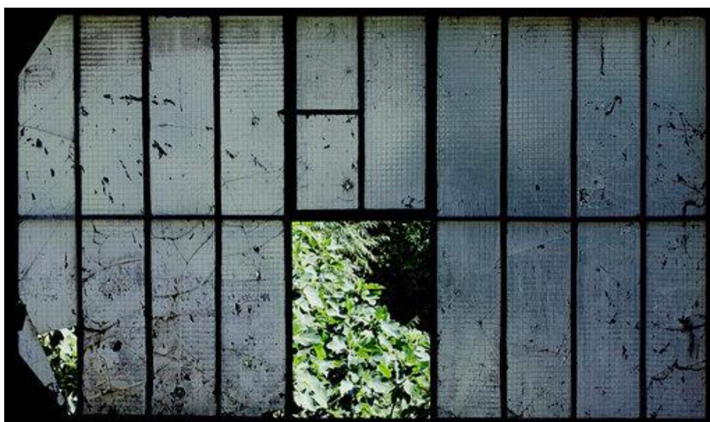
Figure 10. Fenêtre (Barjols) 0903_028 , 2010, archival ink jet print, 43 x 56 cm. (17 x 22 in.).

I think it is important to show at least four of these, to get a good impression of the wide scope of emotions conveyed by the photographs.