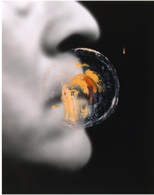
Figure 1. Soubresauts #54, 1997, oil and pastel on photograph, 26 x 20 cm. (10 x 8 in.)