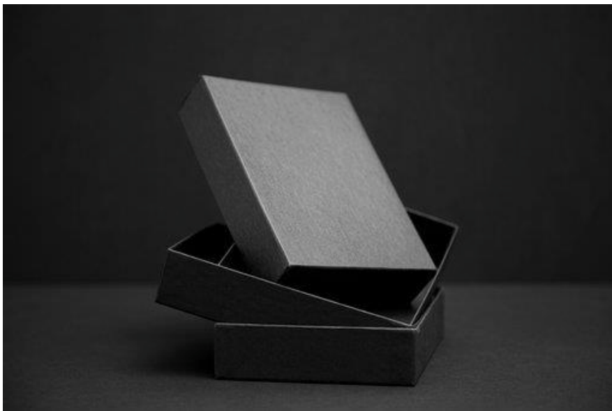
Figure 16. Déboitements # 15B , 2015, archival inkjet print, 60 x 90 cm. (24 x 35.5 in.).

The whole series was done with a very limited use of color: all of the images are monochromatic. Each image is of black boxes on a black background. I used deep blacks and intense contrasts to give the photographs a sense of gravity that the paintings didn't have. This emotional intensity was better aligned with the location itself and its secretive historical truth.