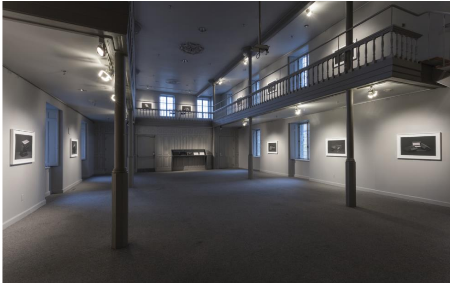
Figure 15. Installation view, 2015, Chapelle Historique du Bon-Pasteur, Montreal.

The whole series was done with a very limited use of color: all of the images are monochromatic. Each image is of black boxes on a black background. I used deep blacks and intense contrasts to give the photographs a sense of gravity that the paintings didn't have. This emotional intensity was better aligned with the location itself and its secretive historical truth.