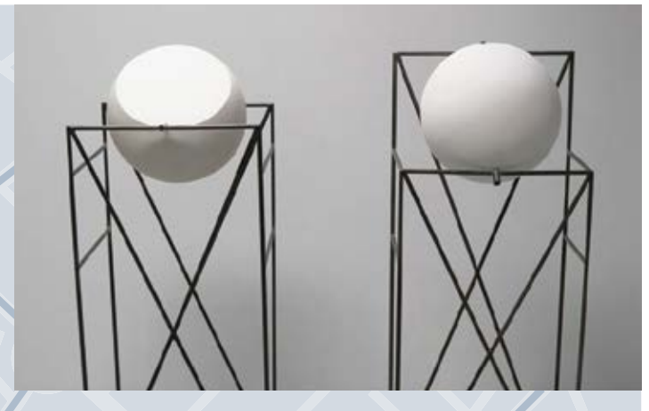
Sphere I & II, Lyndl Hall. Photo courtesy of artist.

Arrow, Lyndl Hall. Photo courtesy of artist.