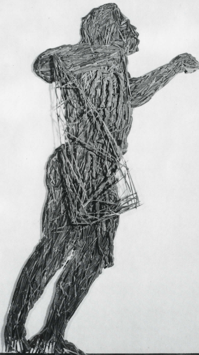
UNTITLED (maquette) Wood 61" x 29" x 3", 1985