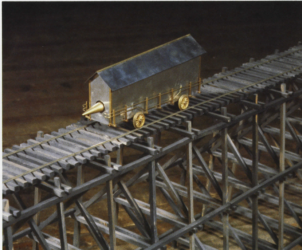
DETAIL Vehicle 11" x 4 \frac{3}{4} " x 3"

ROCKET POWERED VEHICLE Wood/Metal/Light/Motor/Solid Fuel Rocket 21" x 48" x 41 feet 1984