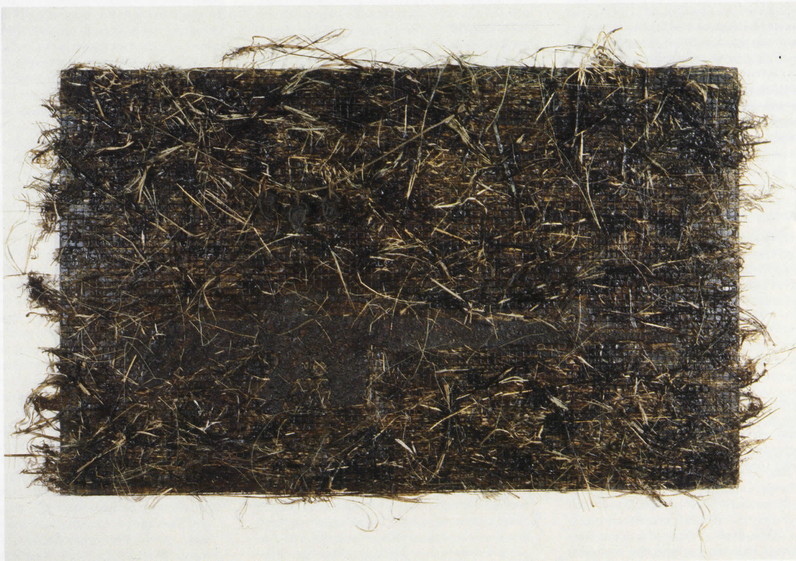
ROCK 'N ROLL, MARY JANE, AND LOVE BEADS Wire/Wood/Encaustic/Tar/Grass, 35" x 59", 1986