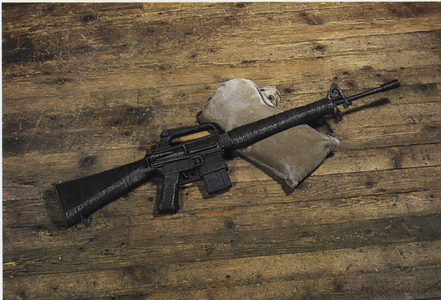
M-16 Wire 10" x 39½" x 3", 1986