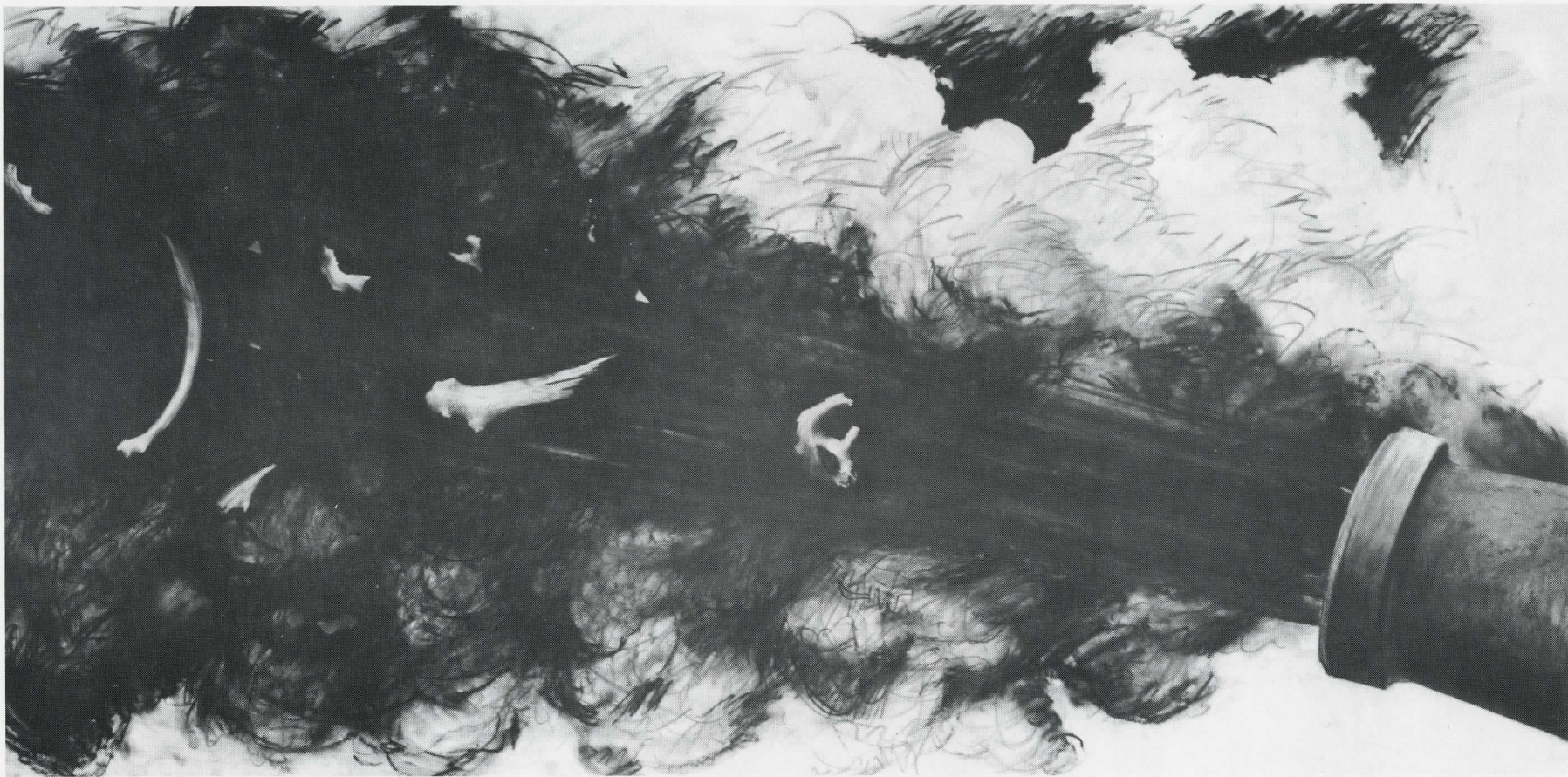
THE FALSE DMITRY Charcoal 35" x 69", 1984