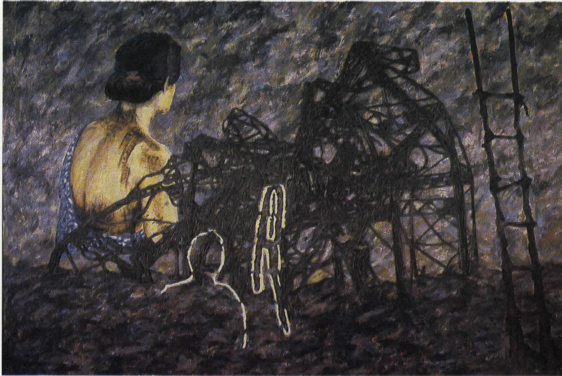
UNTITLED Encaustic/Wood 96" x 144", 1985