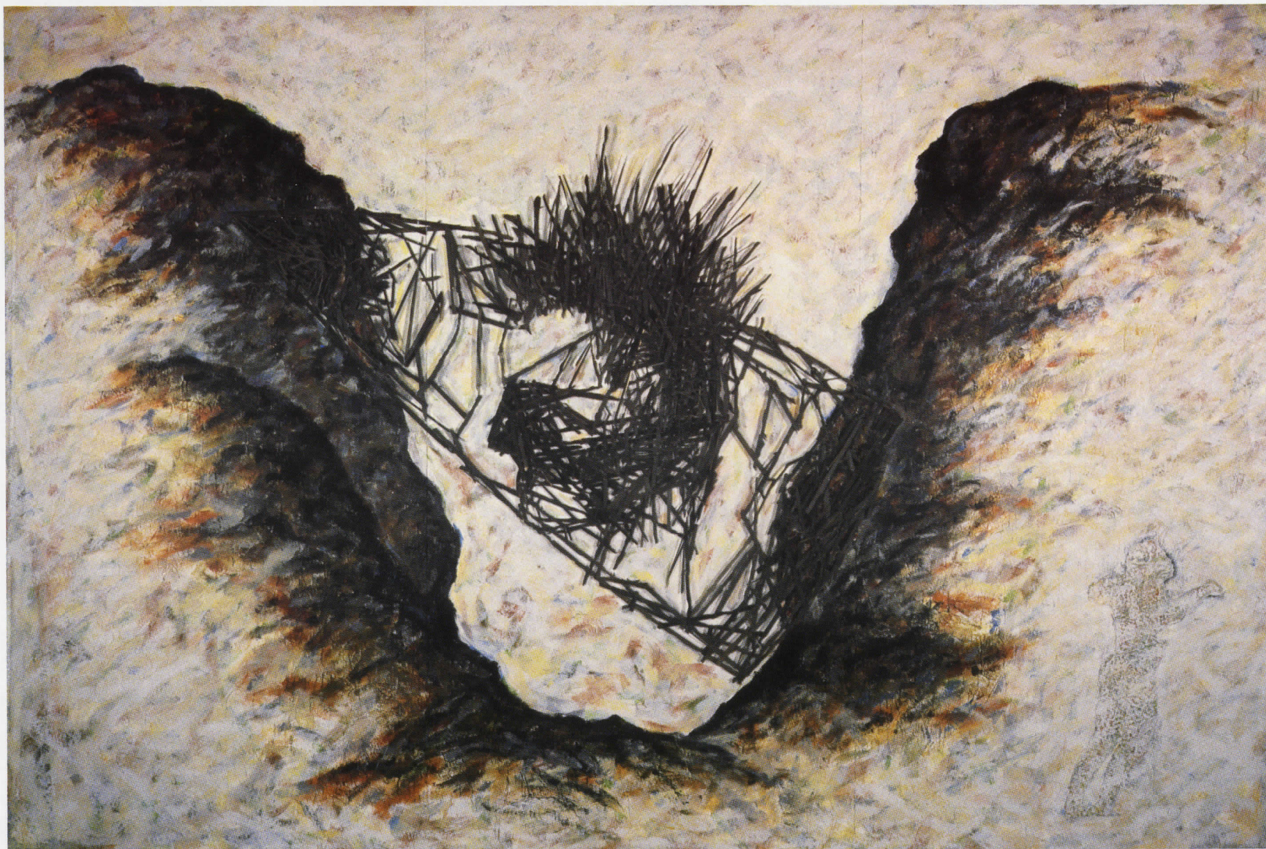
UNTITLED Encaustic/Wood 96" x 144", 1984