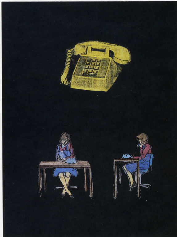
Preliminary drawing for Survey installation