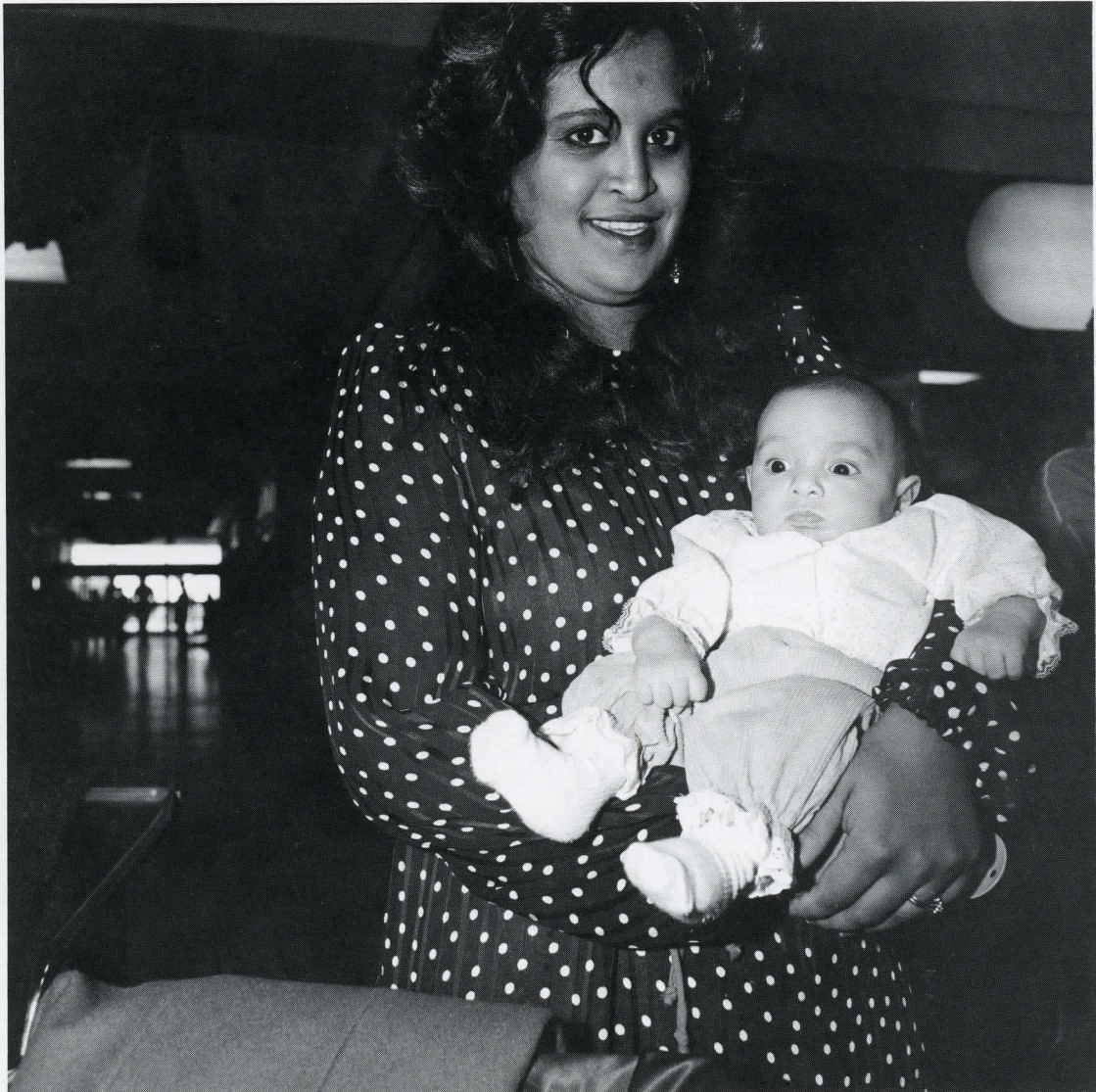
Untitled, (Christmas, Garden City Mall), 1985/86