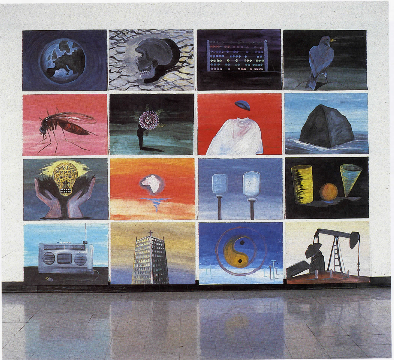
Some preliminary drawings from the Fracture Series