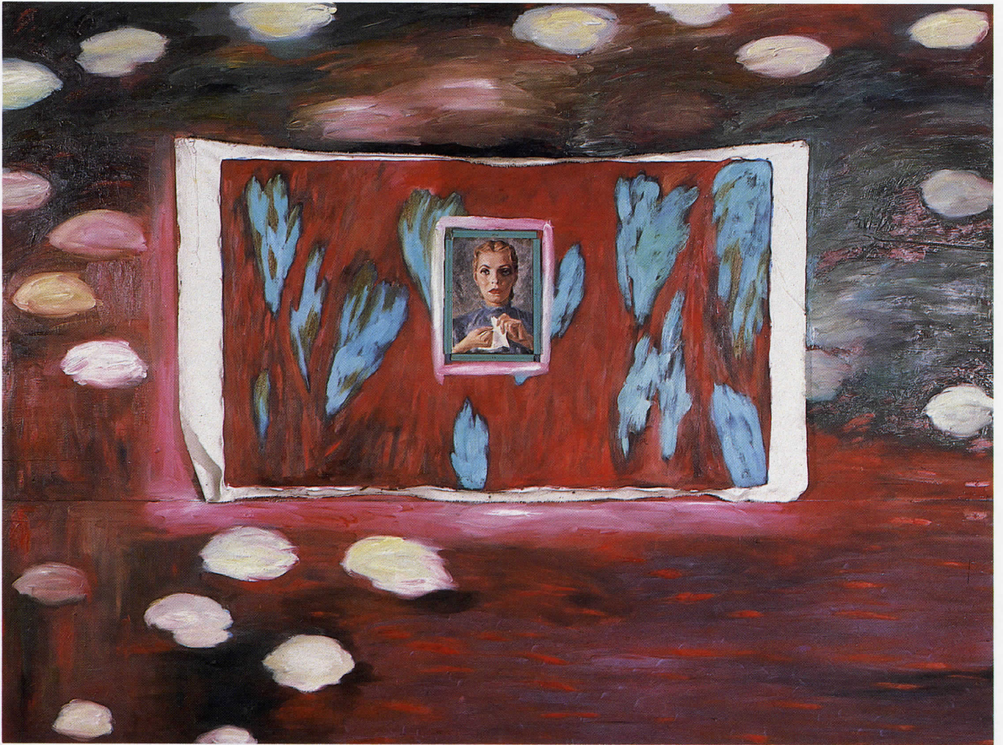
Falling into the Lake