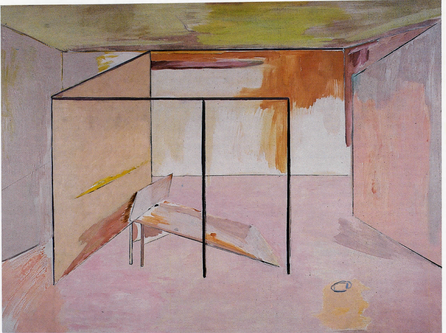
Look at Me