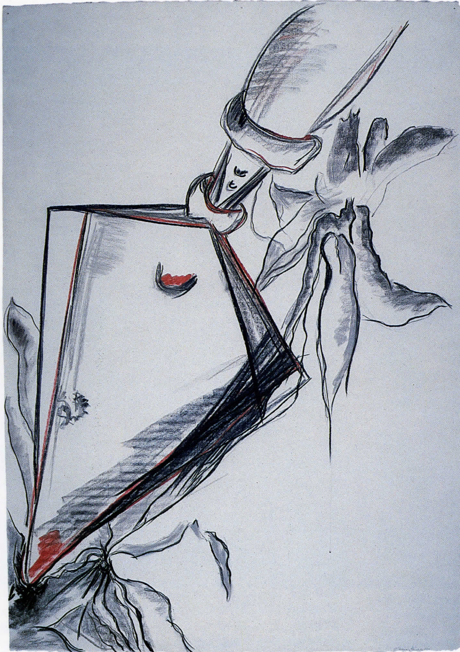
Spade and Flower—2