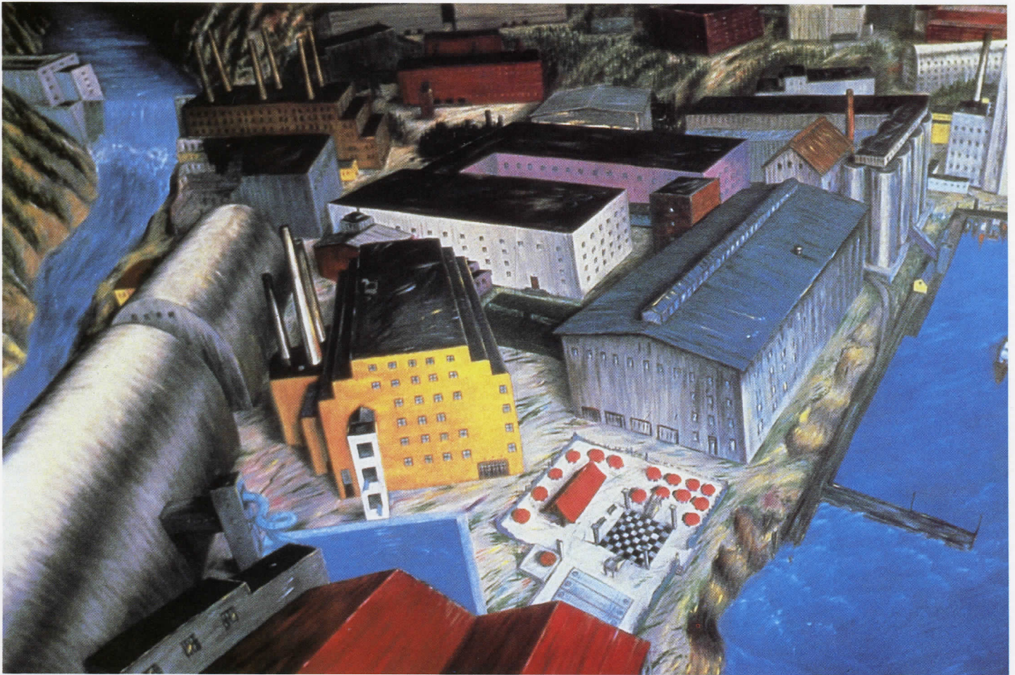
IV Converting the Powell River Mill to a Recreation and Retirement Centre