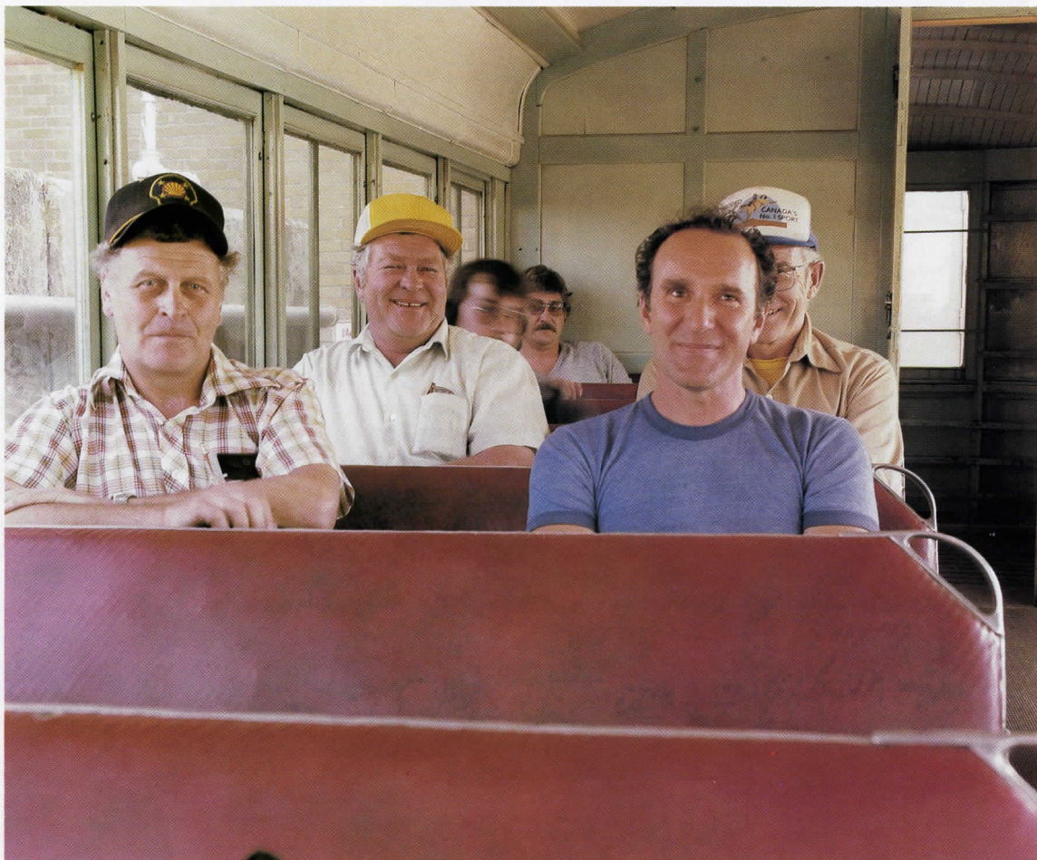
Slave Falls Generating Station (rail bus), Winnipeg Hydro, June 1986