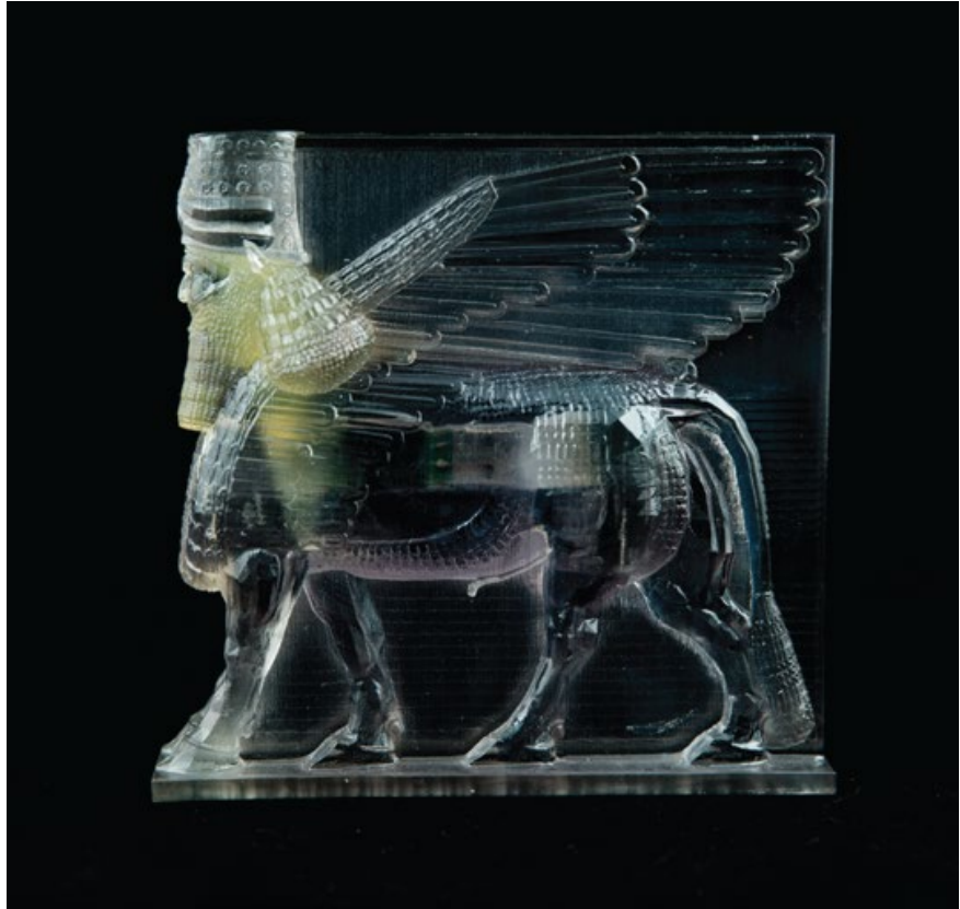
Morehshin Allahyari, Material Speculation: ISIS, Lamassu , 2015

riod city of Hatra and a series of objects from the Assyrian city of Nineveh. Going beyond metaphoric gestures, Material Speculation offers a practical and political archival methodology for endangered or destroyed artifacts. In line with Allahyari's previous work, it also proposes 3D technologies as a tool of resistance. For this project, a flash drive and memory card containing data such as images, videos, maps, and