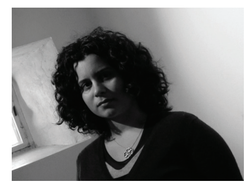
Kika Nicolela, What do you think of me?, 2009.