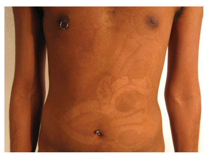
Brendan Fernandes, Changing to Summer, 2005.

<sup>5</sup> Homi Bhabha, "Of mimicry and man: The ambivalence of colonial discourse," in <u>The Location</u> <u>of Culture</u> (New York: Routledge, 1994), p. 85-92. Becoming 'white' by [colonial] mimicry reforms the artists as a recognizable Other, "as a subject of difference that is almost the same, but not quite [white]."