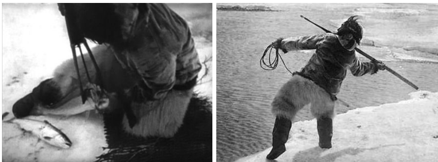
Nanook of the North , Robert Joseph Flaherty, 1922 (left and right)