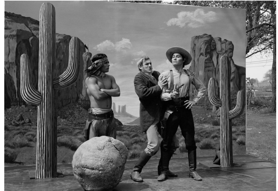
Shooting Geronimo, 2007, Kent Monkman

French performance artist extraordinaire, Orlan, who is well-known for her live plastic surgery performances, has created a new series of works she calls "self-hybridization." Instead of undergoing the painful process of surgery, she uses digital technology. In a series that began with African and Mayan cultures, she focuses on the works from George Catlin's "Indian Gallery" by inserting herself into the paintings. Her intention is to do several dozen, thereby building and re-enacting her own "Indian Gallery".