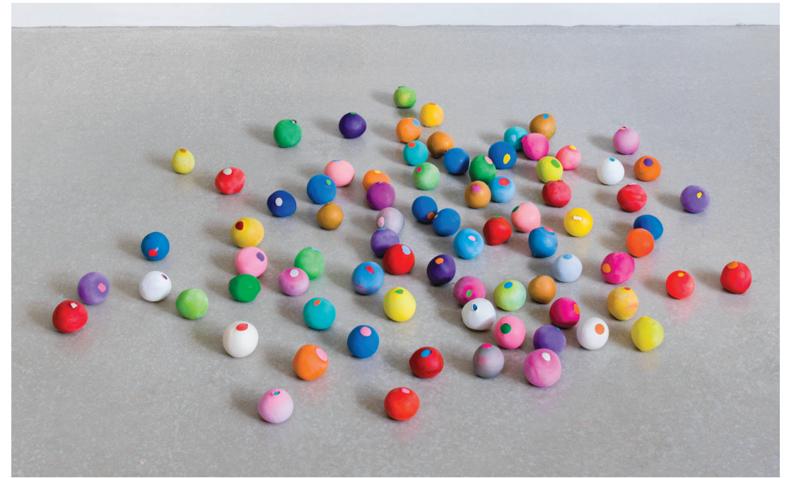
Claire Fontaine, Untitled (Corps étranger) , 2017. Latex balloons, plastic bags, hempseed, yellow and red millet, linen seeds, canary seeds, and whole oats. Eighty-one individual elements, dimensions variable.

Water as a medium of storytelling and archive finds further resonance in Deborah Ligorio's Care: A Somatheory Encounter (2017). The work comprises a video and an installation in which