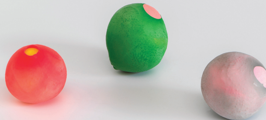
Claire Fontaine, Untitled (Corps étrangers) (detail), 2017. Latex balloons, plastic bags, hempseed, yellow and red millet, linen seeds, canary seeds, and whole oats. Eighty-one individual elements, dimensions variable.

Workshop presented in preparation for The Let Down Reflex , curated by Amber Berson and Juliana Driever for Take Care, Circuit 2: Care Work, October 16–November 4, 2017 at the Blackwood Gallery.