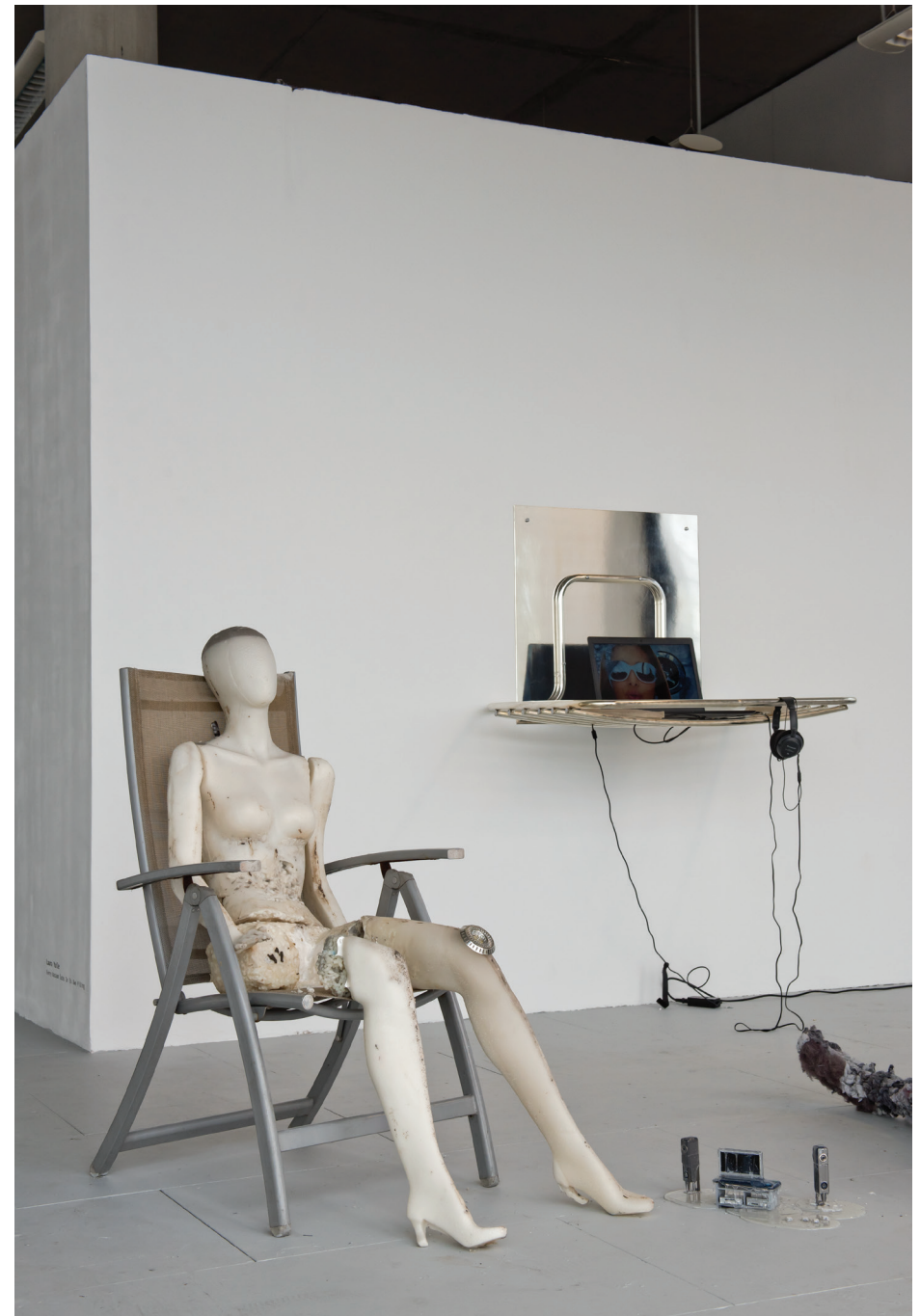
Laura Yuile, Mother Figure #1 and Public Feature (installation view), 2017. Steel, chrome paint, laptop, digital video, soap, eucalyptus oil, dirt hand-picked from “The Street,” Stratford, Westfield, London, small hi-fi system, small “home” decorative wooden word blocks, glass wax.