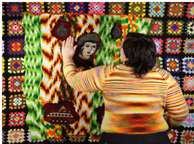
Allyson Mitchell, Afghanimation , 2008, video still.