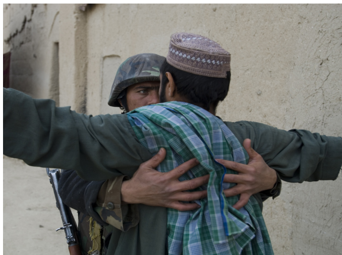
Louie Palu, from the series Zhari-Panjwai: Dispatches from Afghanistan , 2007, detail.

In War at a Distance , the depiction of war through a diverse range of images and sounds is thus a rhetorical strategy that refuses to settle on a singular representation of conflict but instead, constructs a multidimensional public experience of a war that is itself multidimensional, fragmentary and distanced. The point however is not to create an exhibition of contradictions. Rather, it is to explore ways to open thought about the war to new perspectives and questions that have remained closed off in discussions about Canadian