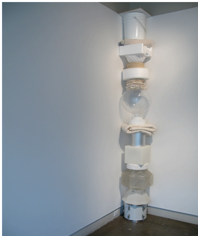
Kelly Lycan, white corner stack , 2009