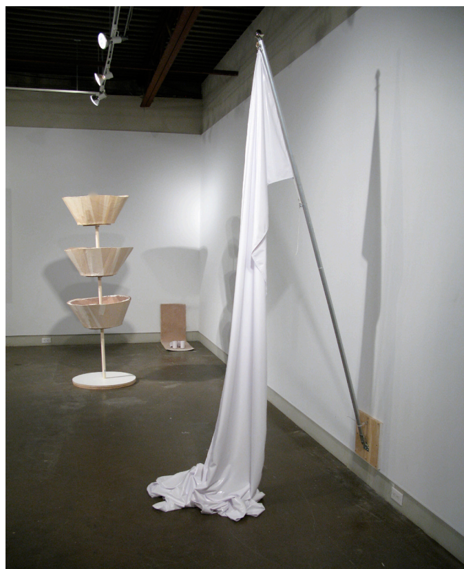
Kelly Lycan, Surrender Forever , 2009

Lycan's installation also evokes the relationship between shared histories and private collections (the exhibition includes examples of Lycan's private collections of things).