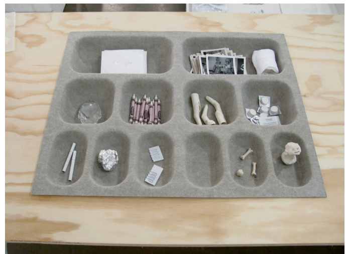
Kelly Lycan, Installation view, WHITE HOT , 2009