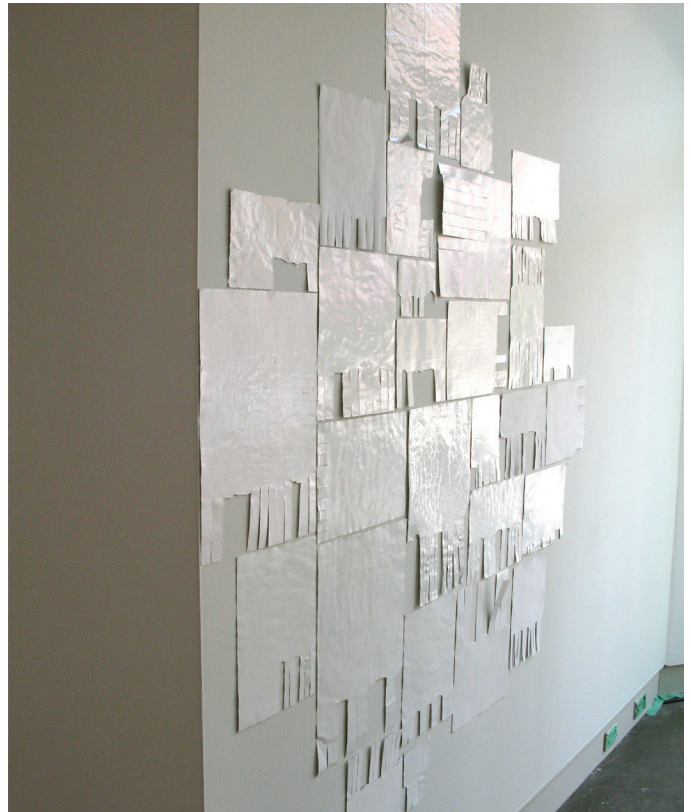
Kelly Lycan, Tab Flyers , 2009

pieces and include $2 and Under which consists of cheap commodity items (for two dollars and under) dangling from chandelier-like clusters with hooks, zip ties and plastic clips; Three Tiers are display-like tiers, lined with carpet but remaining empty; and a porcelain collectible of Princess Di is found in a styrofoam cooler. All of these examples look like a cross between art and commodity, plinth and display furniture. Sample Photos, 2 years 2 months are laminated personal photos, reminiscent of laminate colour samples. Here an efficient commodity-based tool is refashioned to serve as a display device for keeping track of research, ideas, as well as documents of everyday life and relationships. Last