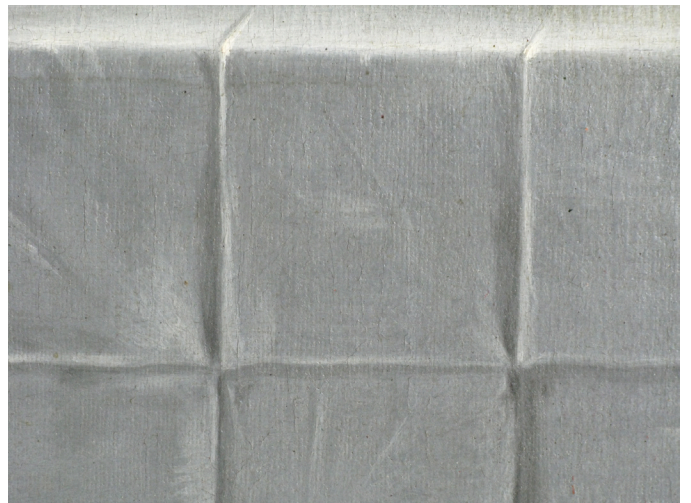
Kelly Lycan, Last Supper (detail), 2009