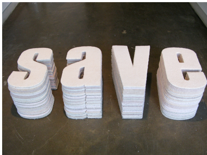
Kelly Lycan, Save, 2009

strategies of "stealing" from the most recent fashions, and incorporating the newest modes of production – as well as those fashions and production modes that had fallen into obsolescence—as a powerful lens through which to view the mythologies of a new capitalist culture. The appropriation of the new by art was, on the one hand, utopian—in that it attempted to harness new production modes as a way to project a better future; on the other hand, it imitated the forms of popular culture in a parodic and cynical fashion – as détournement, an effective way to create a disruptive image